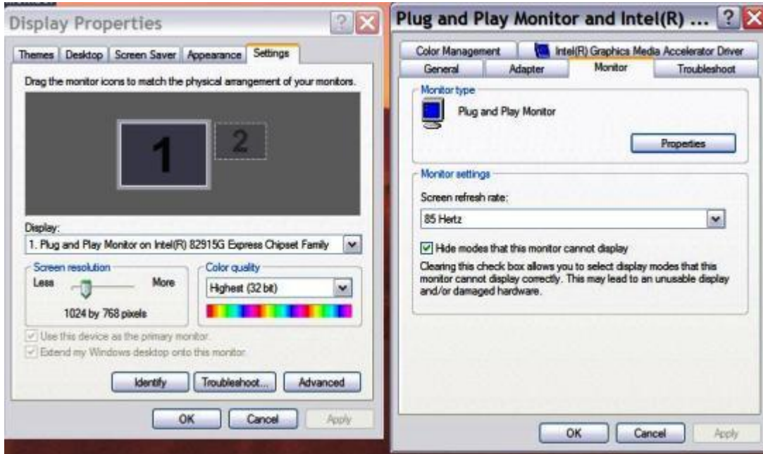
Advanced Display Properties